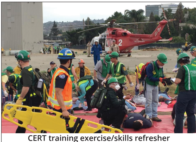
CERT training exercise/skills refresher

If a disastrous event overwhelms or delays the community's professional response capabilities, CERT members can assist themselves, their families and others, by applying the basic response and organizational skills that they learned during training. Following a disaster, these skills can help save and sustain lives until help arrives. CERT skills also apply to smaller scale daily emergencies.