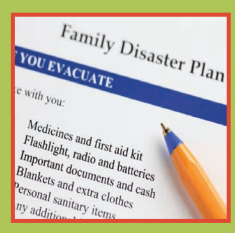
Be sure to have an emergency plan and a way to contact your family.