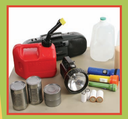
Be sure to have seven days of emergency supplies.