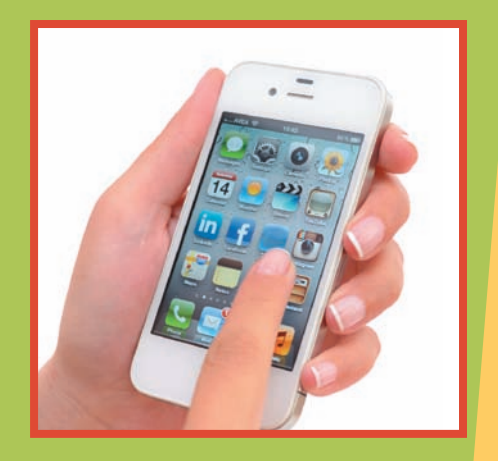
Sign up for your city's alert notification system or stay informed by radio or by computer.